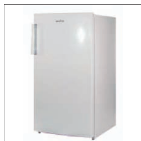
Frigider ARCTIC FB 155 Cod 025 010 020 198