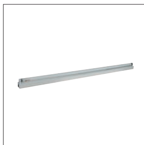
Lampa fluorescenta FIA cu instalatie electrica completa 1x40W Cod 019.010.110.000