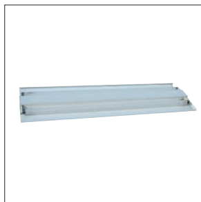
Corp fluorescent tip OCTANORM cu doua tuburi D-171 Cod 019.010.200.000