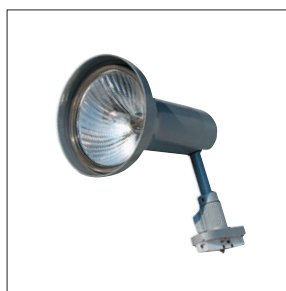
Spot halogen SY STAR 100W EUR 15.00 Cod 019.010.185.000