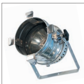
Reflector PAR64 500-1000W EUR 40.00 Cod 019.010.200.020