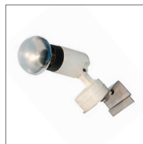
Lampa spot SS30 100W EUR 12.00 Cod 019.010.200.008