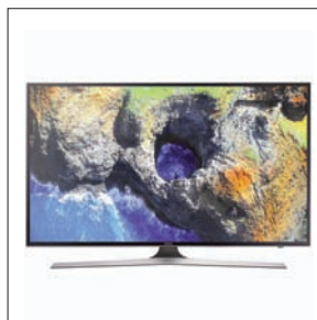
TV SAMSUNG UHD, (diagonala ecran: 163 cm) Cod 025 010 130 047