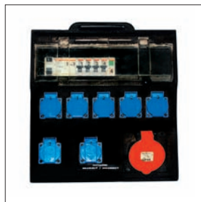
Panou Electric 380V/220V Cod 019.010.265.000