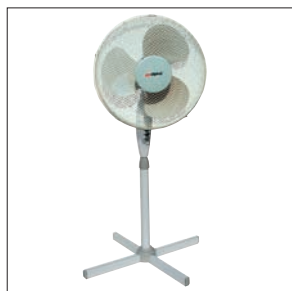
Ventilator cu picior Cod 025.010.500.020