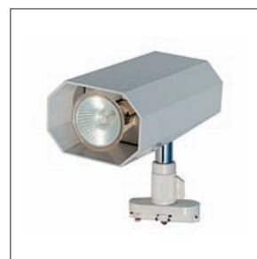
Spot halogen SY STAR 50W(A) EUR 15.00 Cod 019.010.186.000