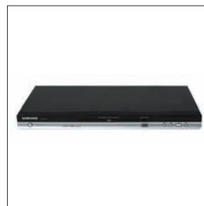
DVD Player Cod 025 010 130 030