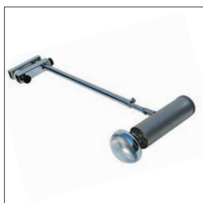
Lampa spot cu brat 100W EUR 12.00 Cod 019.010.181.000