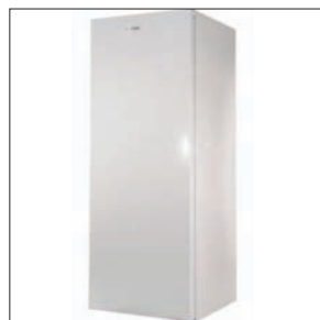
Frigider ARCTIC 255 l Cod 025 010 020 199