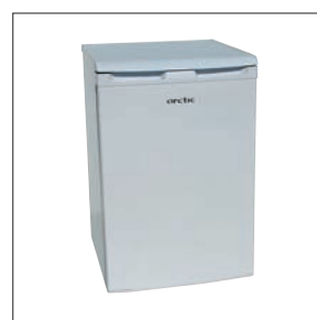
Racitor (140 l) Cod 025 010 070 010 (55 x 61 x 84 cm)