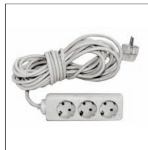
Prelungitor 230V, 10A, 5m Cod 019.010.279.000