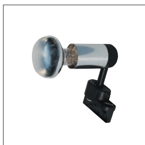
Lampa spot 100W EUR 12.00 Cod 019.010.188.000