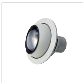
Lampa spot 100W EUR 12.00 Cod 019.010.170.000