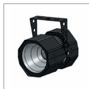
Reflector LED VIRGO EUR 40.00 40W 4350 LM 4100 K Cod 019.010.200.045