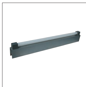
Corp fluorescent tip SS30 cu un tub D-170 Cod 019.010.190.000