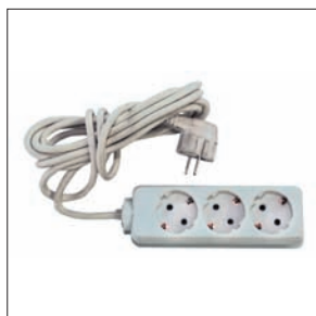
Prelungitor 230V, 10A, 3m Cod 019.010.277.000