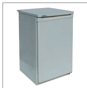
Frigider ARCTIC (180 l) Cod 025 010 070 020