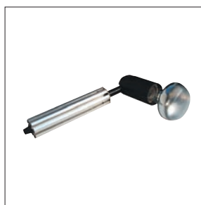
Lampa spot stut OCTANORM EUR 12.00 Cod 019.010.187.000