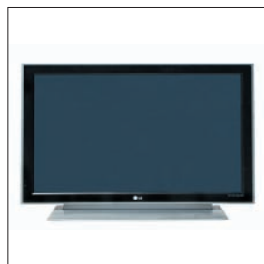
TV Plasma (diagonala ecran: 107 cm) Cod 025 010 130 040