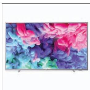
TV LED SMART 4K, UHD ultrasubtire (diagonala ecran: 126 cm) Cod 025 010 130 045