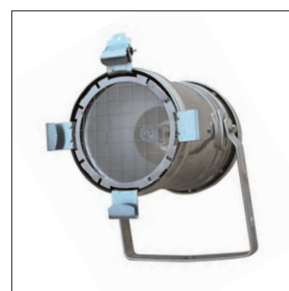
Reflector HIGHLITE HQI 150W EUR 35.00 Cod 019.010.390.000