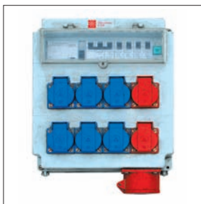
Panou Electric OCTANORM Cod 019.010.275.000