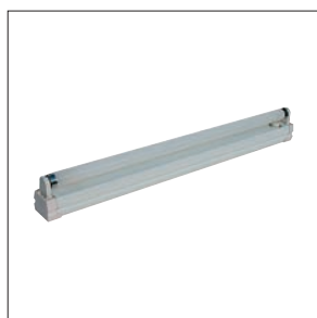
Corp fluorescent tip SS30 cu un tub D-170 - A Cod 019.010.190.001