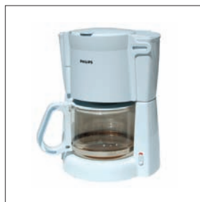
Filtru de cafea Cod 025.010.120.010