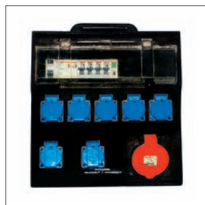
Panou Electric 380V/220V EUR 100.00 Cod 019.010.265.000