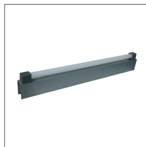
Corp fluorescent tip SS30 EUR 15.00 cu un tub D-170 Cod 019.010.190.000