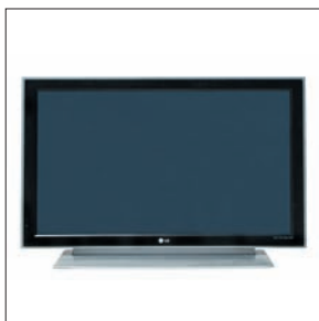
TV Plasma EUR 25.00/zi (diagonala ecran: 107 cm) Cod 025 010 130 040