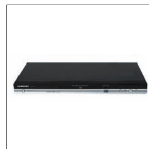
DVD Player EUR 40.00 Cod 025 010 130 030