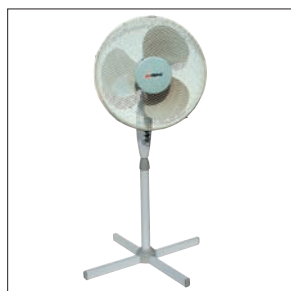
Ventilator cu picior EUR 7.00 Cod 025.010.500.020