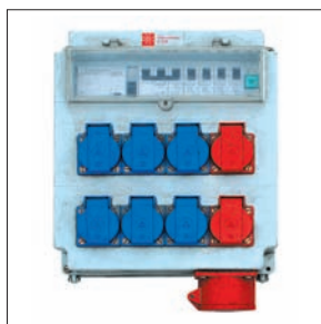
Panou Electric OCTANORM EUR 120.00 Cod 019.010.275.000