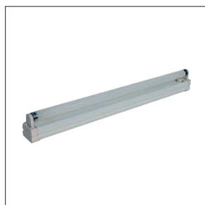
Corp fluorescent tip SS30 EUR 18.00 cu un tub D-170 - A Cod 019.010.190.001