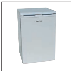
Racitor (140 l) EUR 24.00 Cod 025 010 070 010 (55 x 61 x 84 cm)