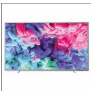
TV LED SMART 4K, UHD ultrasubtire EUR 40.00/zi (diagonala ecran: 126 cm) Cod 025 010 130 045