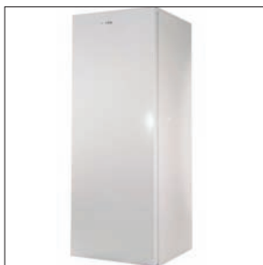
Frigider ARCTIC 255 l EUR 55.00 Cod 025 010 020 199