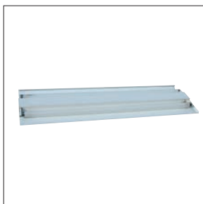
Corp fluorescent tip OCTANORM EUR 20.00 cu doua tuburi D-171 Cod 019.010.200.000