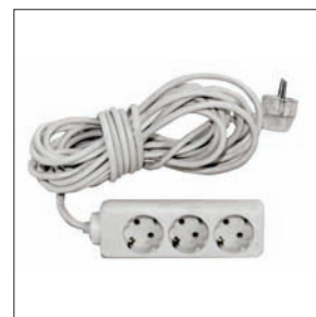
Prelungitor 230V, 10A, 5m EUR 10.00 Cod 019.010.279.000