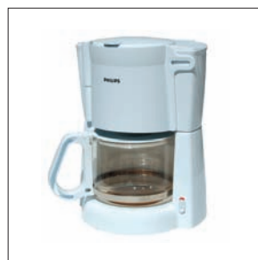
Filtru de cafea EUR 4.00 Cod 025.010.120.010