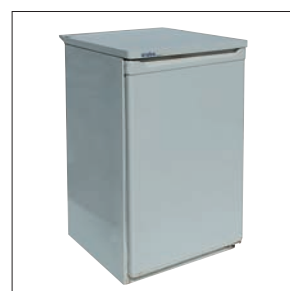
Frigider ARCTIC (180 l) EUR 44.00 Cod 025 010 070 020