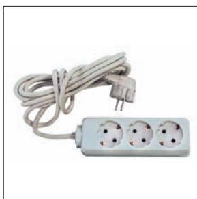
Prelungitor 230V, 10A, 3m EUR 10.00 Cod 019.010.277.000