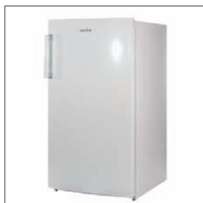
Frigider ARCTIC FB 155 EUR 25.00 Cod 025 010 020 198