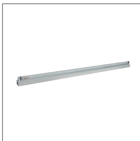
Lampa fluorescenta FIA EUR 15.00 cu instalatie electrica completa 1x40W Cod 019.010.110.000