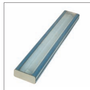
Corp fluorescent tip SYMA STAR EUR 18.00 Cod 019.010.200.001